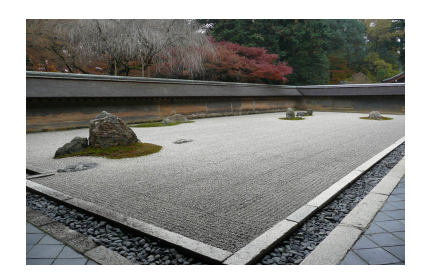
Wednesday, May 21, 7PM